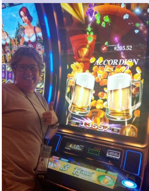
← CASINO NIGHT OFF NETWORKING SOCIAL →