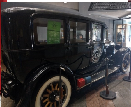
↑ TOUR OF WASHOE COUNTY SHERIFF'S FORENSICS CRIME LAB